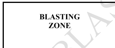
About 48" x 48"

1. The posting of signs warning against the use of radio transmitters on all roads within 350 feet of blasting operations.